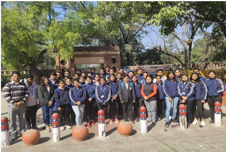
Image 2: Students exploring Delhi University campus along with faculty members.

Budhera, Gurugram-Badli Road, Gurugram (Haryana) – 122505 Ph. : 0124-2278183, 2278184, 2278185